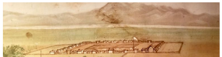
(Parowan Fort, Wooden Version) 851-1872 Drawing at the Pipe Spring National Monument)

We welcome everyone to participate, reconnect, and contribute to preserving the legacy of Parowan Old Rock Church. Join us for a weekend of fun, reflection, and giving back as we celebrate Parowan's history and preserve its future. Please mark June 20 - 21 on your calendar and invite a few friends and family both in town and out of town. Let's make this a wonderful event!